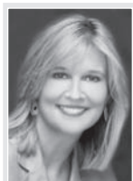
Kathleen Parker COLUMNIST

Kathleen Parker is a columnist for The Washington Post .